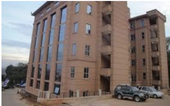
IDI, Kampala, Uganda