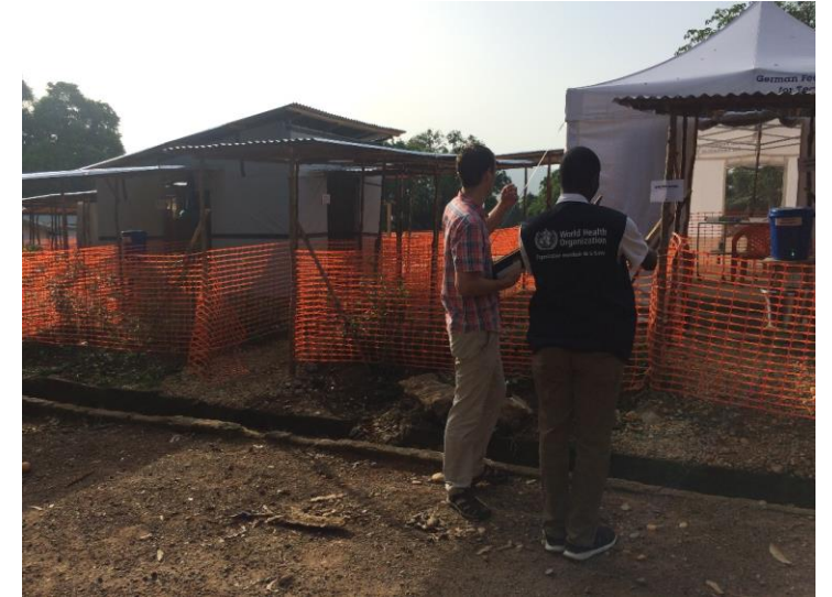
Makeni, Sierra Leone, 2015