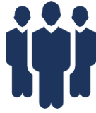
Executive Advisory Board